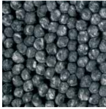
stone - 2908 marble