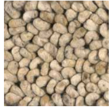
stone - 292 grege