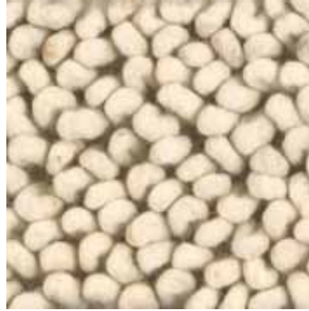
stone - 290 ivoire