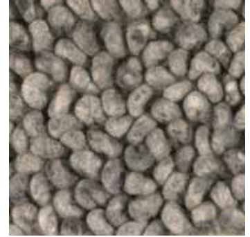
stone - 297 charcoal