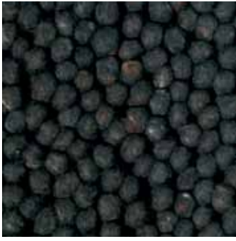
stone - 2913 maure